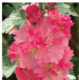
Carmine Rose FHAA02