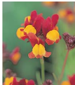
Scarlet with Yellow Eye FLN108