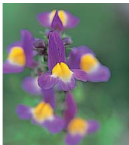
Violet with Yellow Eye FLN109