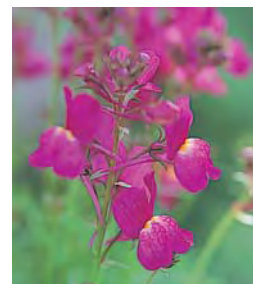
Magenta Rose FLN101