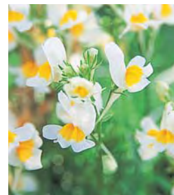
White with Yellow Eye FLN111