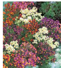
Autumn Mix FLN120