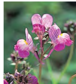
Speckled Pink FLN102