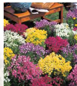
Spring Mix FLN119