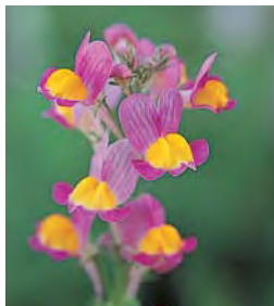
Pink with Yellow Eye FLN110